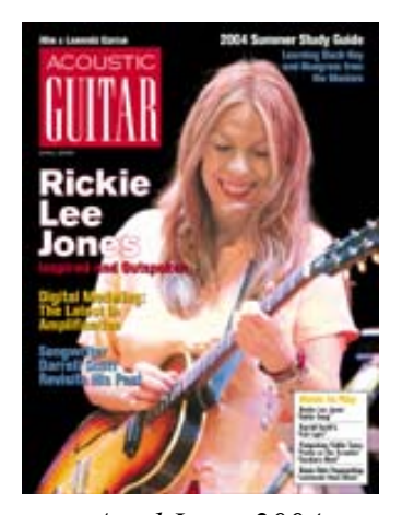
April Issue 2004